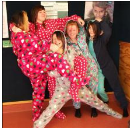
Yr 10 Textile Students modelling their one piece PJ's